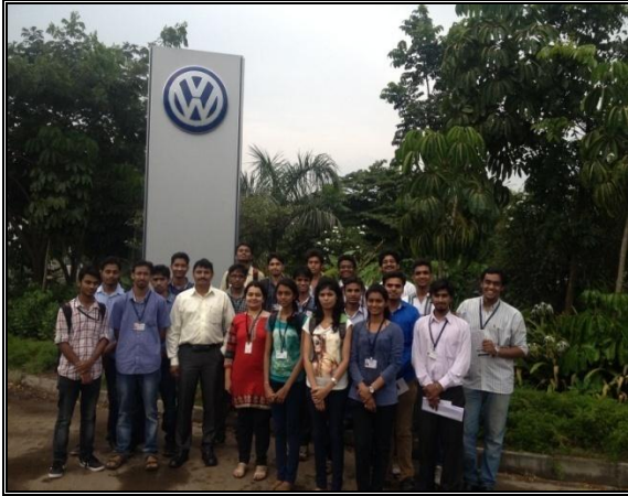
Industrial Visit at VolksWagen on 07/10/14 for B.E students