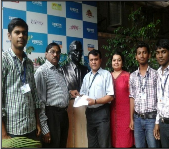
Donation to SAKAL TIMES for MALIN GAON RELIEF FI IND