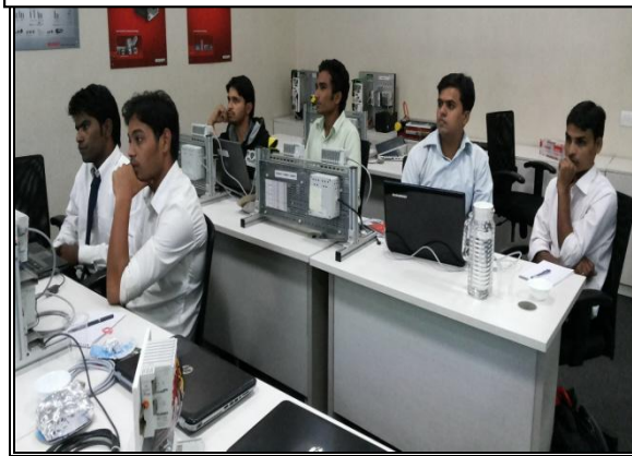
Beck-Off workshop on TwinCAT 2 Training: PLC programming at Beckhoff Automation Pvt. Ltd