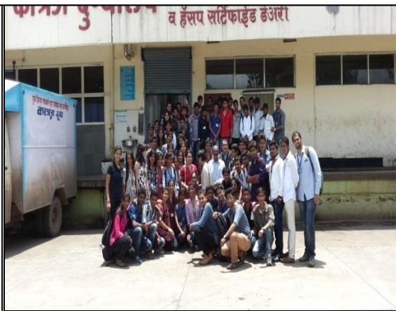
IV at Katraj dairy on 25/07/14 for T.E students