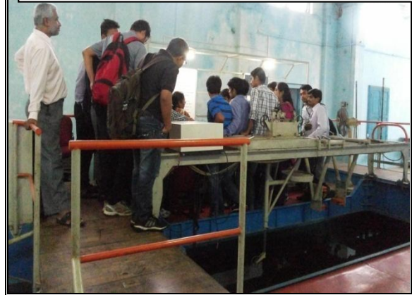
IV at CWPRS for B.E students on 23/07/14