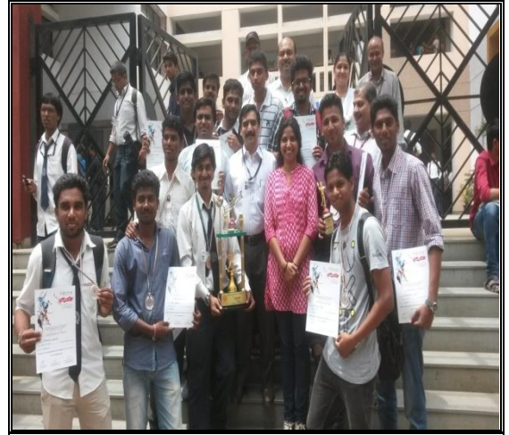
RUNNERS UP in National Level Inter-Engineering Cricket Tournament summit'14 held at MIT, Pune.