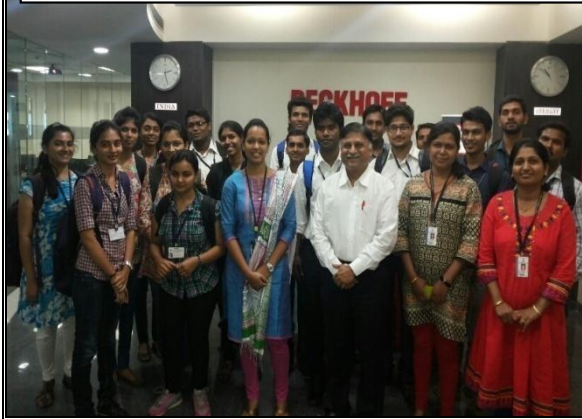
IV at Beck-Off Automation for B.E students on 15/07/14