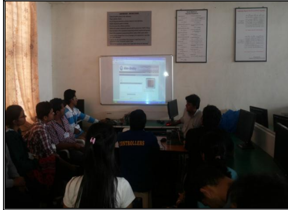
Workshop on “ Industrial Automation System: PLC, SCADA and HMI ” organized by the department under ISOI students chapter in coordination with Prolific System and Technologies Pvt.Ltd.pune