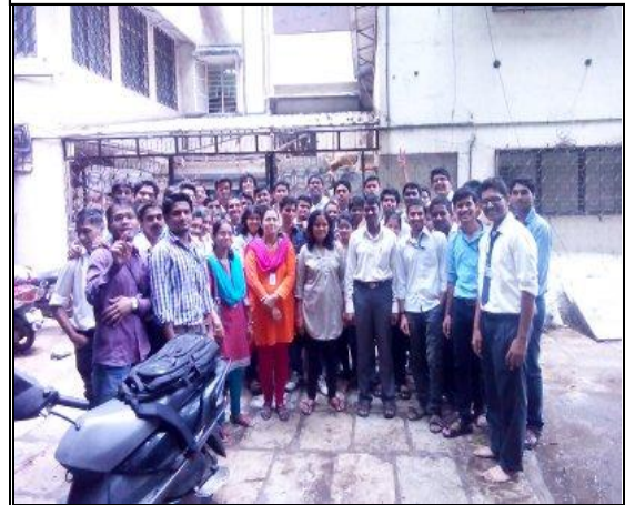
IV at Melux Control on 24/07/14 for S.E students